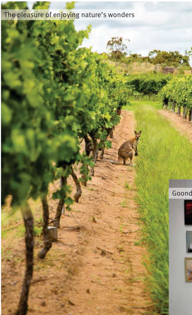
The pleasure of enjoying nature's wonders