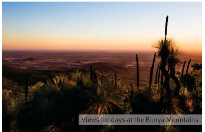
Views for days at the Bunya Mountains