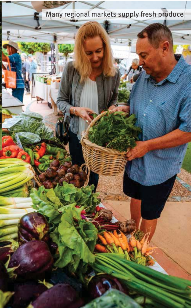
Many regional markets supply fresh produce