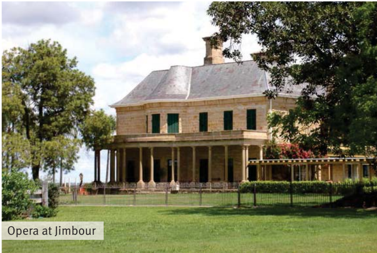
Opera at Jimbour