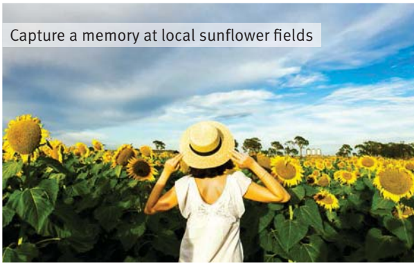
Capture a memory at local sunflower fields