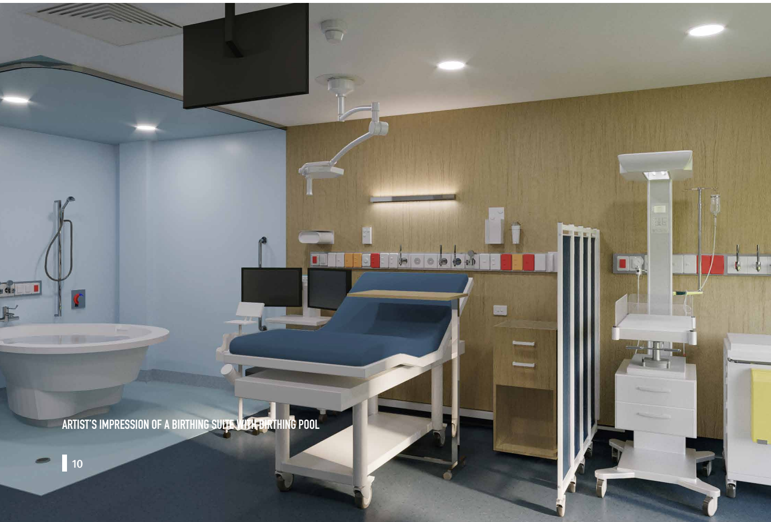
ARTIST'S IMPRESSION OF A BIRTHING SUITE WITH BIRTHING POOL