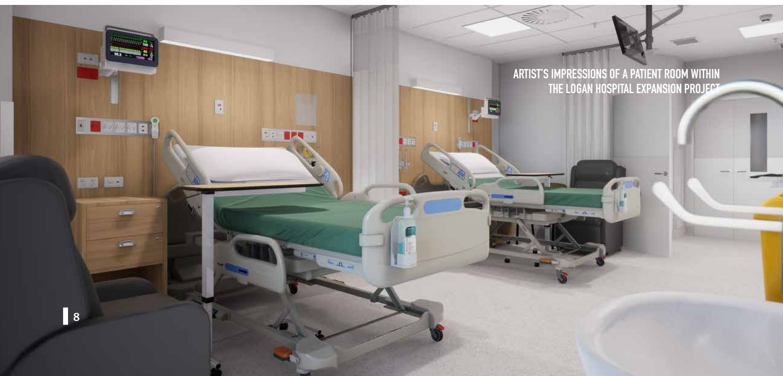
ARTIST'S IMPRESSIONS OF A PATIENT ROOM WITHIN THE LOGAN HOSPITAL EXPANSION PROJECT