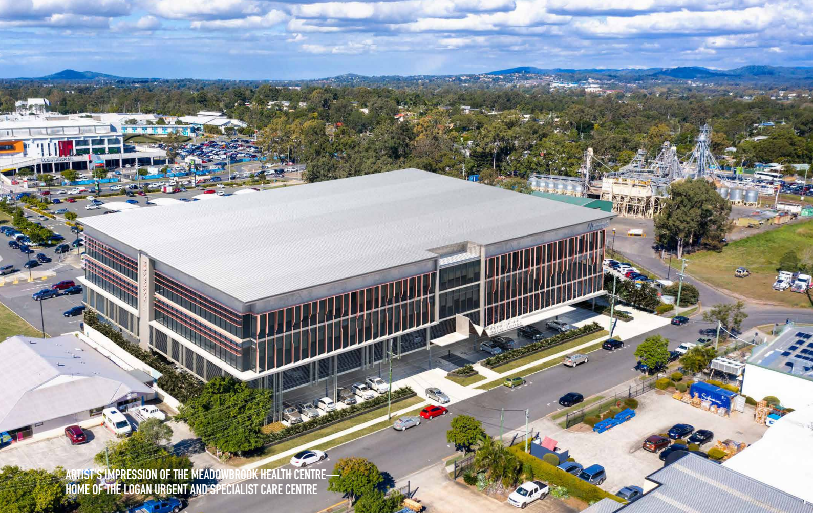
ARTIST'S IMPRESSION OF THE MEADOWBROOK HEALTH CENTRE — HOME OF THE LOGAN URGENT AND SPECIALIST CARE CENTRE